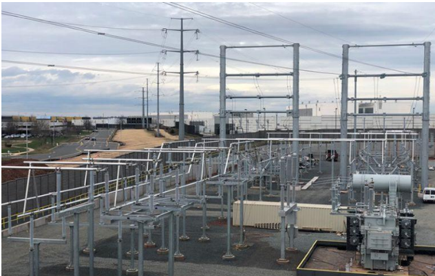
Transmission line and Substation