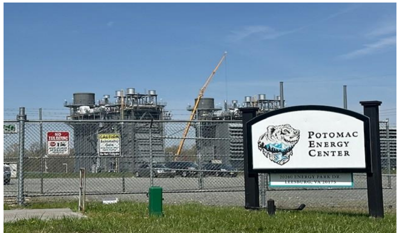
Gas plant in Loudoun County